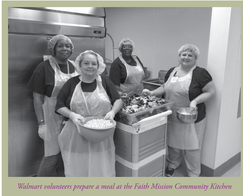
Walmart volunteers prepare a meal at the Faith Mission Community Kitchen

We are grateful for our corporate partner Walmart in helping to provide services to people in need.